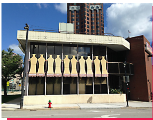
111 W. Kilbourn Milwaukee, WI